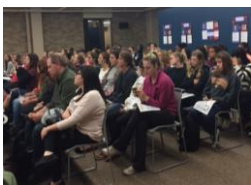
The packed room at the panel discussion, “Your Vote, Know Before You Go” on campus