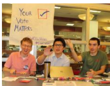
Members of the Japan club calling over other students to come and register to vote at one of the weekly tabling locations