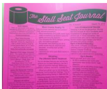
One of the Stall Seat Journals that are in every bathroom stall across campus, with a section encouraging students to register to vote