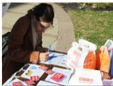
A West Chester Student at the Donut Forget to Vote event filling out a Dub C Votes card after looking up her polling location