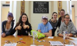
Members of Alpha Phi Omega registering students to vote on National Voter Registration Day.

Share your favorite photos and stories with us from the election!