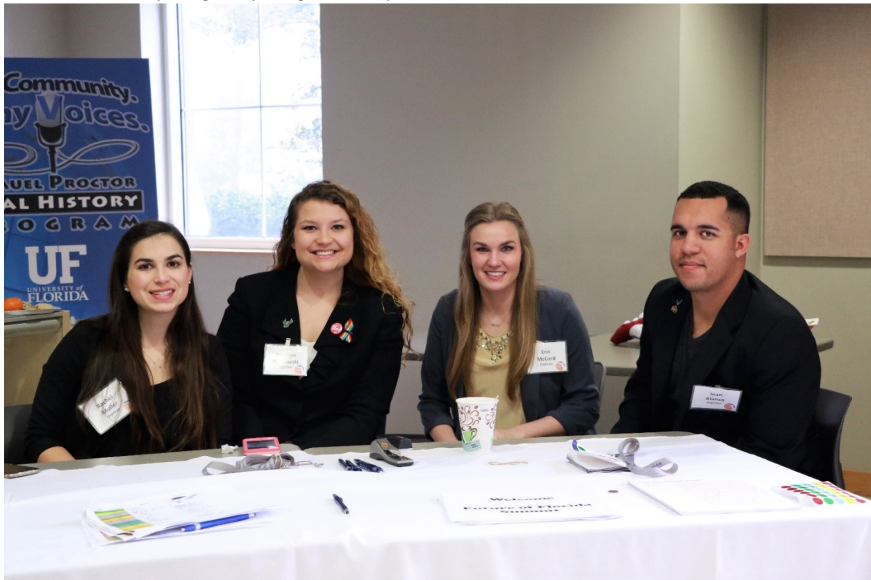
Members of the Future of Florida Summit student organizing committee

Our student-run Future of Florida Summit calls upon the most engaged student leaders from public and private universities across the state to immerse themselves in a key challenge facing Florida and propose policy solutions. Along the way students learn everything from how to capture the attention of busy lawmakers to composing compelling testimony.