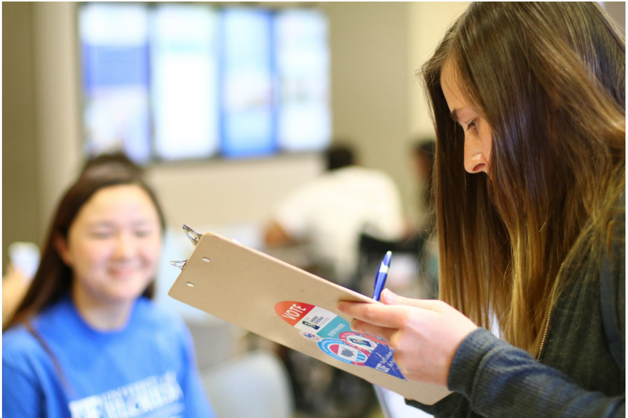
Voter registration drive in Pugh Hall