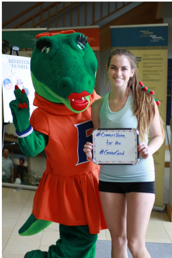
Voter Registration drive and meet and greet with Alberta Gator in Pugh Hall