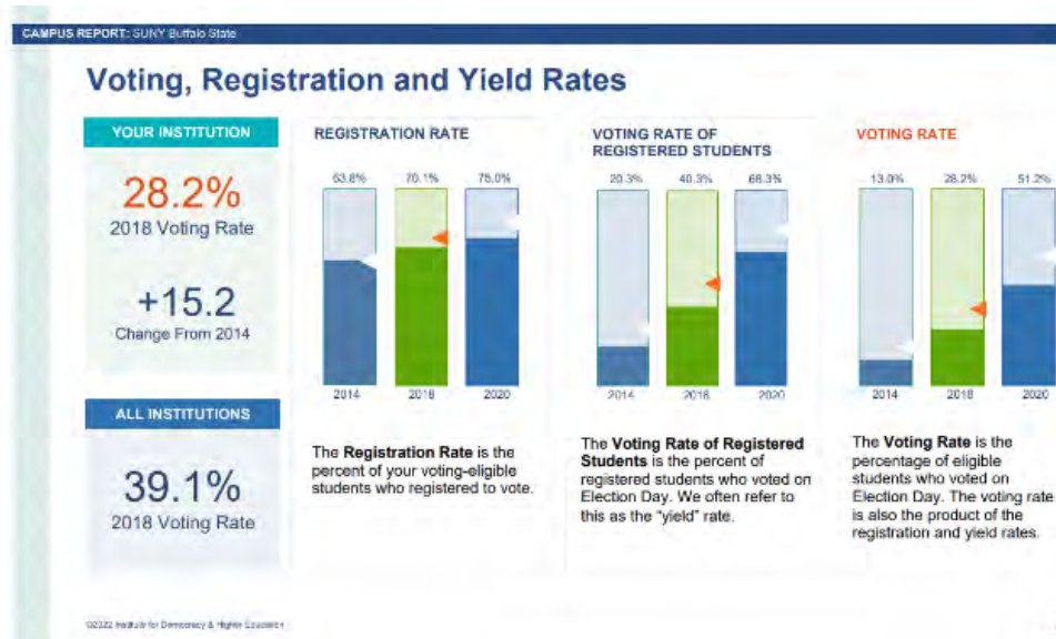
Figure 1. Voting, Registration, Yield Rates

Utilizing National Study of Learning, Voting, and Engagement (NSLVE) data, SUNY Buffalo State University has a lower voting rate than peer institutions but recent efforts to expand voter engagement supports have improved the landscape shown in the graphs below from the 2022 NSLVE data report.