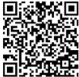
Paws to the Polls website