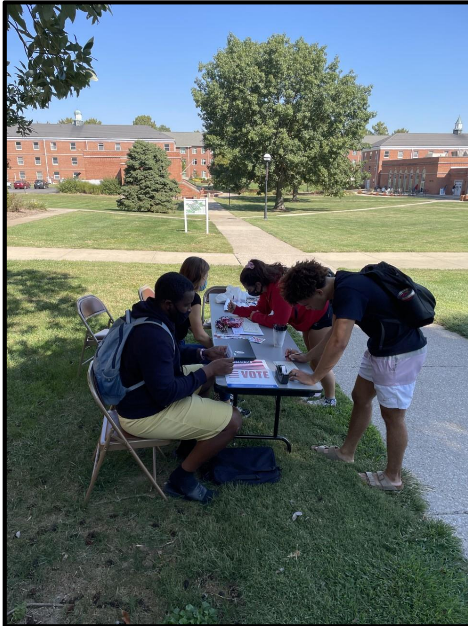
McKendree University, National Voter Registration Day, September 2021

We will measure success in several ways to determine if we have met our goals in fostering civic engagement on McKendree's campus. NSLVE feedback will give us data to compare past student registration and voting rates with current ones. We will also tally participation in voter education efforts. Beyond campus, we will count the community partnerships we develop to encourage engagement between our students and the surrounding municipalities and political campaigns. Finally, we will seek feedback from committee members, faculty, and staff on successful initiatives and areas that can be improved.