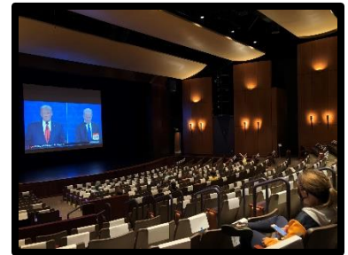
McKendree University Debate Watching Gathering, Fall 2020