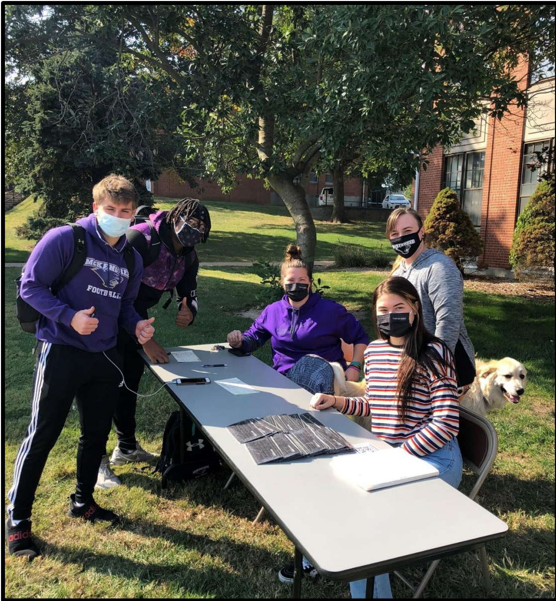
McKendree University Voter Registration Drive, Fall 2020