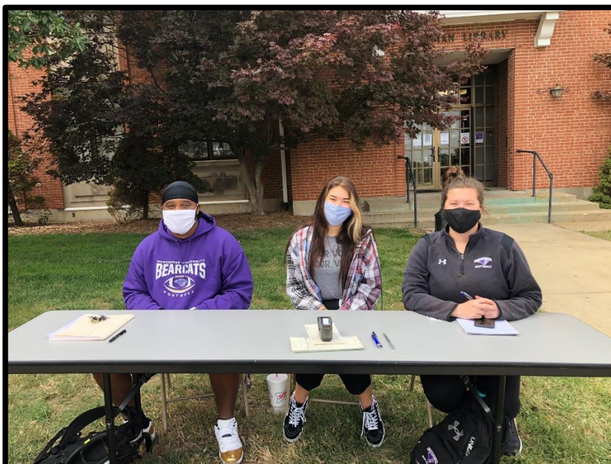
McKendree University Voter Registration Drive, Student ALL IN Members, Fall 2020