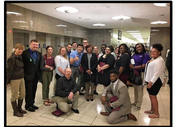
Student Lobby Day, State Capitol, Springfield, Illinois, April 12, 2018

McKendree ALL IN Action Plan Bearcats Vote