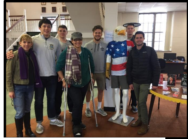
Voter Registration Drive, Holman Library, McKendree University, March 22, 2018

McKendree University remains resolute to civic engagement being a pervasive component of the student experience on campus. See Section III of this action plan for our commitment to civic learning and democratic engagement.