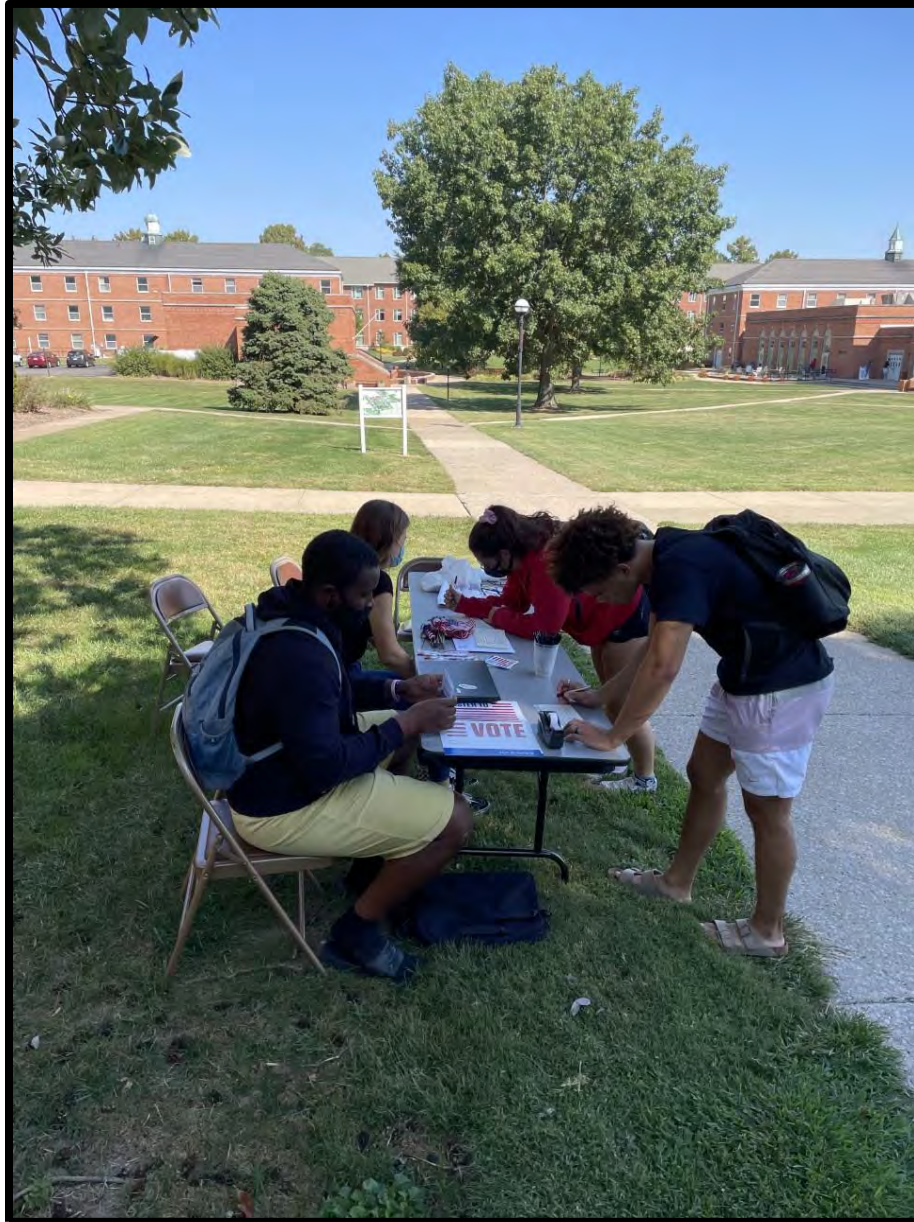
McKendree University, National Voter Registration Day, September 2021