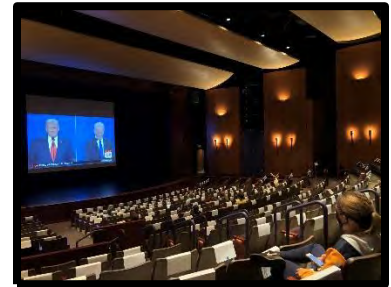
McKendree University Debate Watching Gathering, Fall 2020