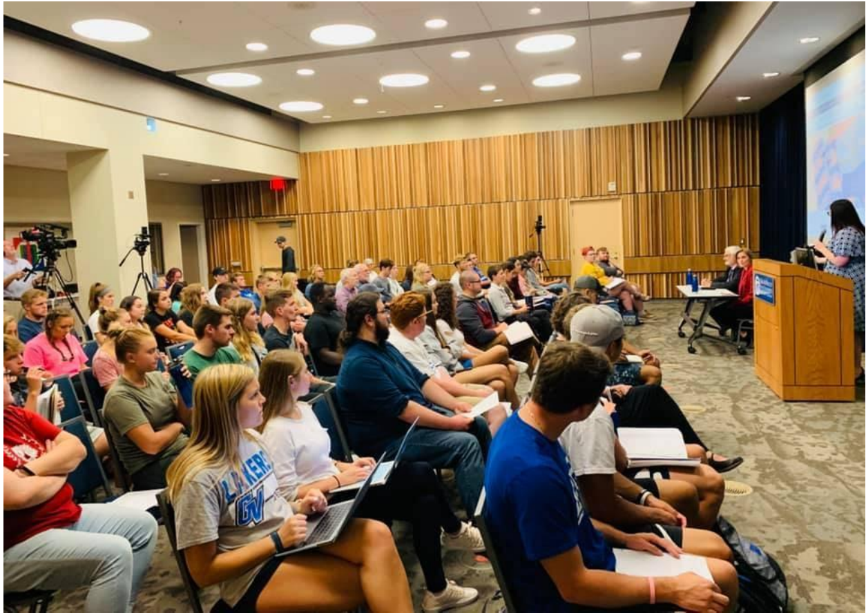
Democracy 101: "PFAS in Michigan"