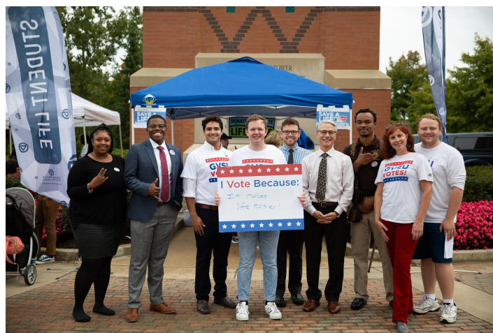
National Voter Registration Day 2018