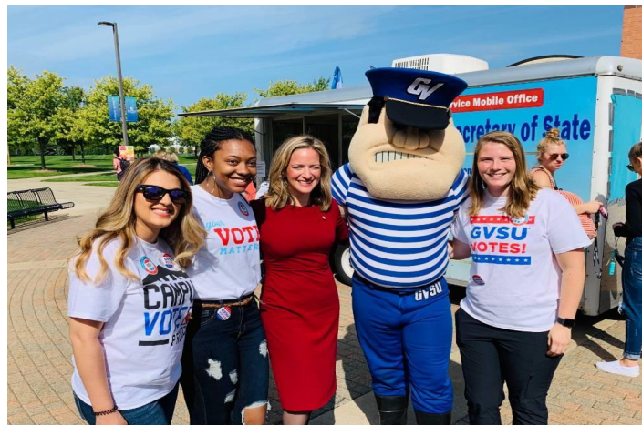
National Voter Registration Day 2019 with MI Secretary of State Jocelyn Benson, reps from Campus Vote Project, Campus Elections Engagement Project, GVSU Votes and Louie the Laker