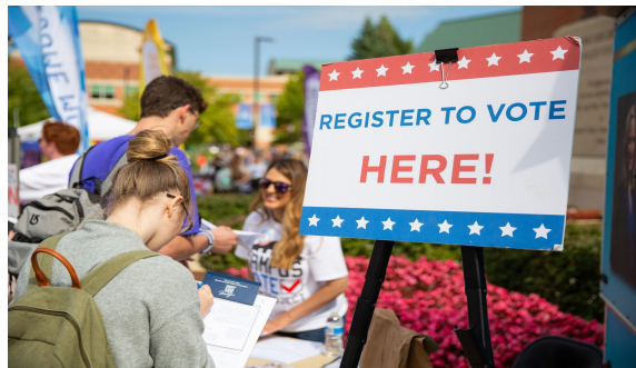
National Voter Registration Day 2019