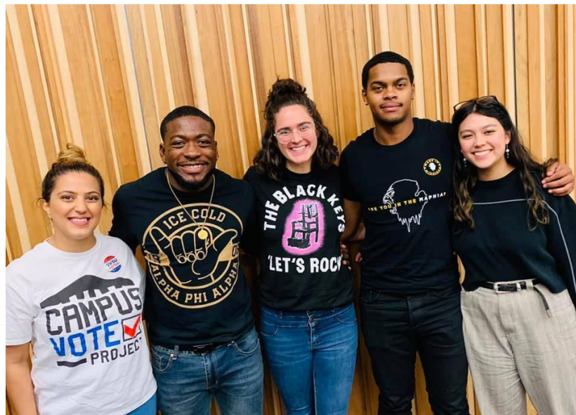
Democracy 101: Youth Political Engagement panel