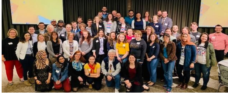
Michigan Student Voter Engagement Summit 2019

Hosted by GVSU, in partnership with Campus Vote Project, Campus Elections Engagement Project, Students Learn Students Vote, All In Campus Democracy Challenge and MI Department of State.