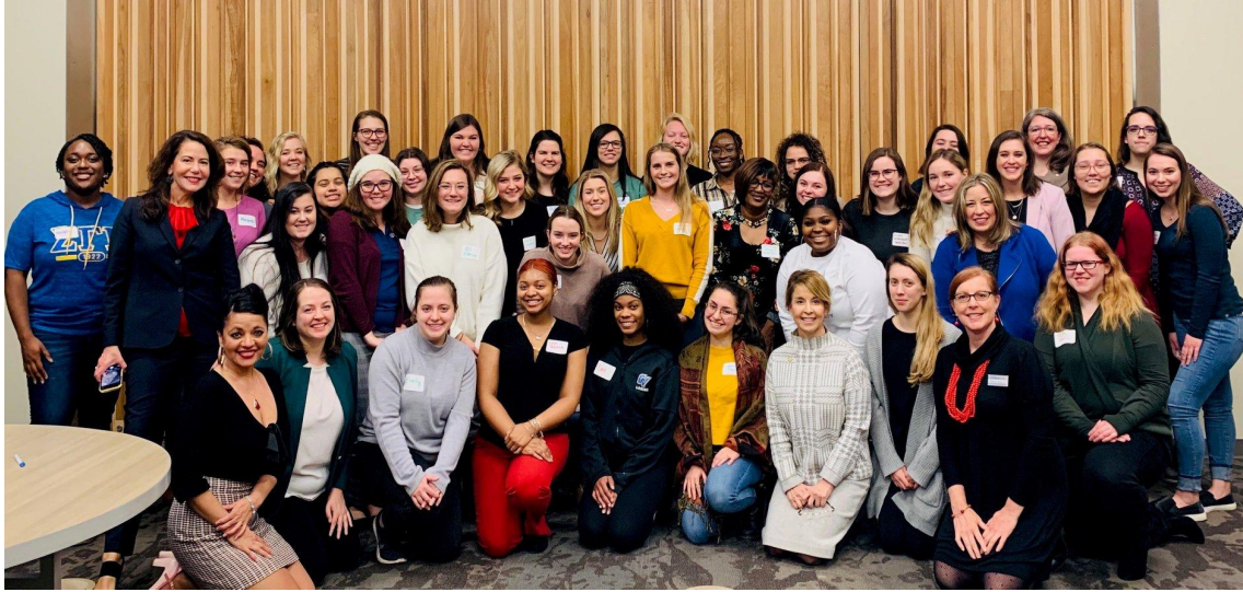
Democracy 101: “Elect Her”, co-sponsored by Running Start, featuring six female-identified state, county and local elected officials for this informative and inspiring workshop, encouraging young women to run for office.