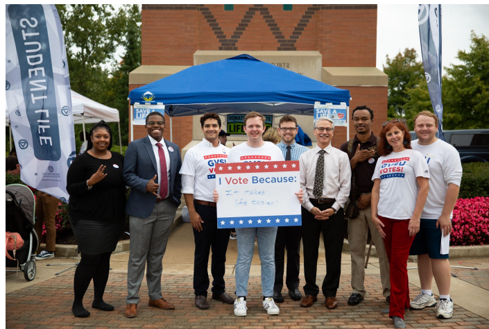
National Voter Registration Day 2018