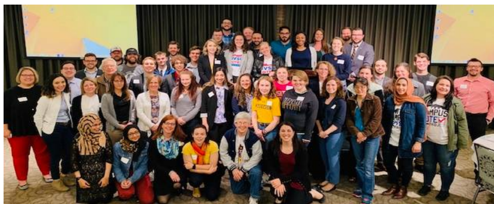
Michigan Student Voter Engagement Summit 2019

Hosted by GVSU, in partnership with Campus Vote Project, Campus Elections Engagement Project, Students Learn Students Vote, All In Campus Democracy Challenge and MI Department of State.