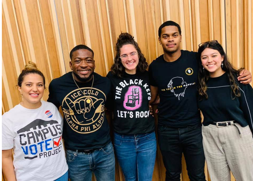
Democracy 101: Youth Political Engagement panel