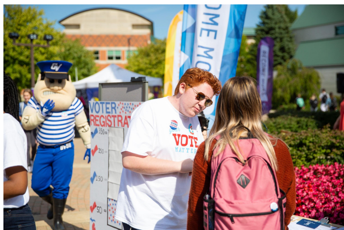
National Voter Registration Day 2019