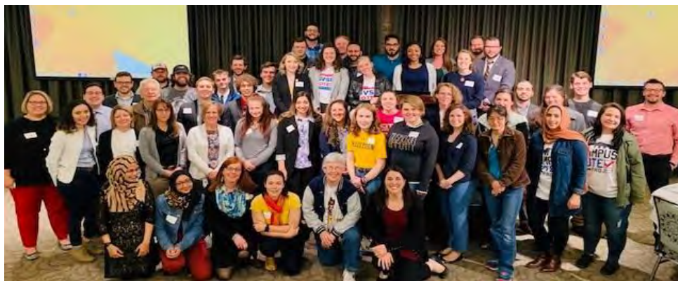
Michigan Student Voter Engagement Summit 2019