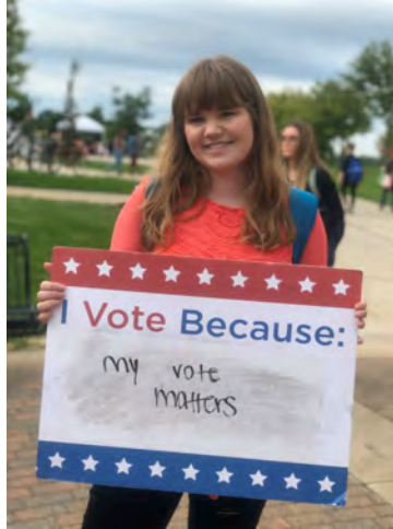
National Voter Registration Day 2019