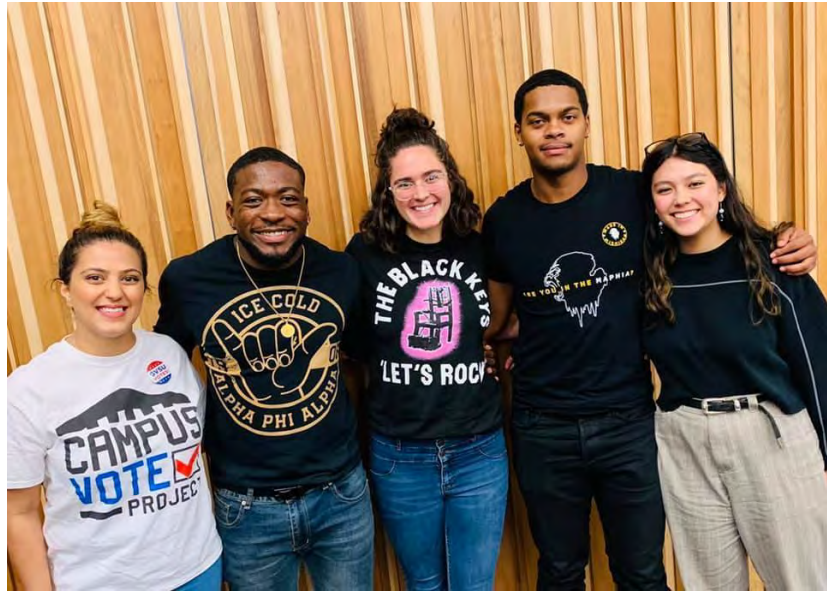
Democracy 101: Youth Political Engagement panel