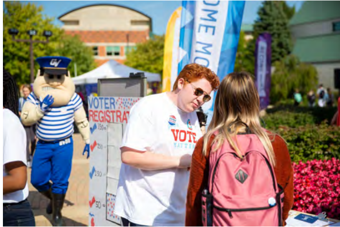
GVSU Votes! 2019