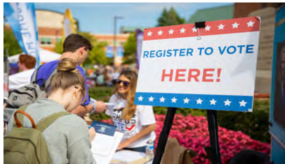
National Voter Registration Day 2019