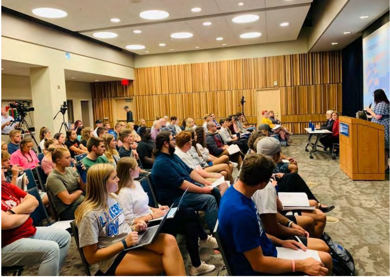
Democracy 101: "PFAS in Michigan"