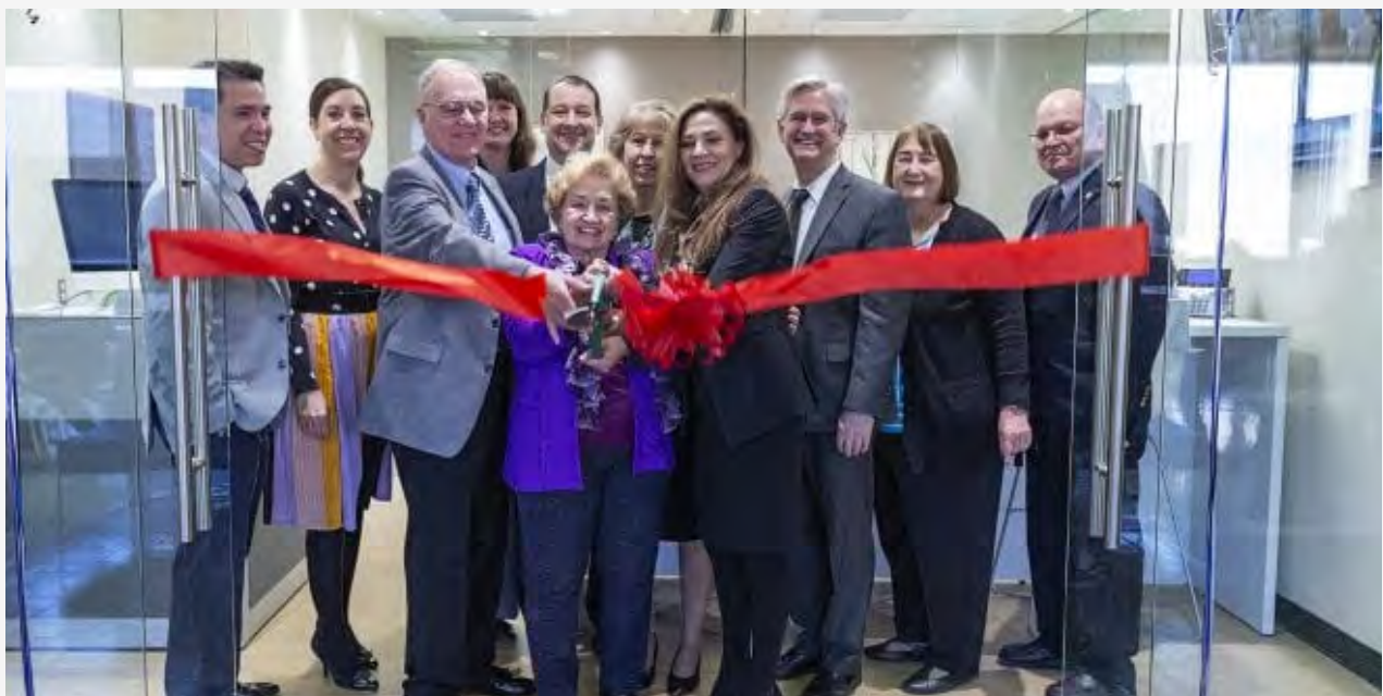
Board members in the grand opening of the first year experience center in 2019.

We are collaborating with the Director of Student Leadership and Campus Life, Vice President of Student Services, and Executive Director of Admissions and Registrar to get students registered to vote.