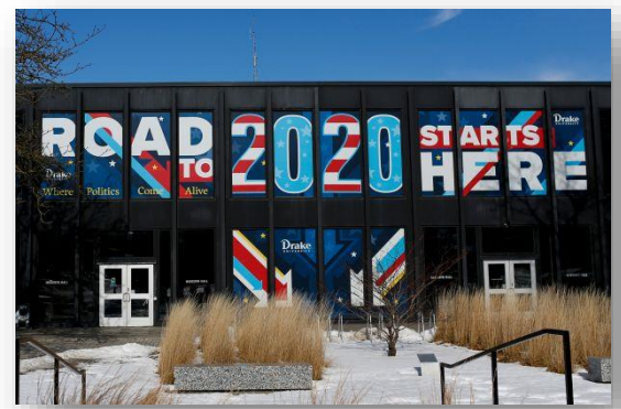
Meredith Hall leading up to the 2020 caucuses