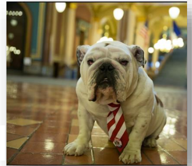
Drake University Live Mascot "Griff" at the Iowa State Capitol