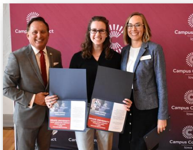
Drake receives awards from ALL IN

Drake University has been a local, state, and national leader in student engagement. Located in Des Moines, IA, Drake is ideally situated as an institution that integrates civic engagement into every facet of our student experience. Over the past decade, Drake has intentionally institutionalized policies and practices to grow student participation in community and political affairs, including the ongoing work of the Political Visitor Team that organizes and coordinates implementation for dozens of candidate, party, and media events (totaling nearly 50 events over the year preceding the 2020 Iowa caucuses), expansion of the Office of Community Engaged Learning (CEL) within the Academic Affairs division of the Provost's office, the creation of a Civic Engagement Senator as an appointed representative of Student Senate, the permanent relocation of the national headquarters of Vote Smart to the Drake University campus, collaborative meetings of students, faculty, and administrative staff to identify and solve institutional challenges to student voter registration and voting and regular collaboration with the Iowa Secretary of State's office, the Polk County Auditor, and Campus Compact. In 2020, Drake's NSLVE Report indicated that 91.6% of students are registered to vote and 80.4% of Drake students voted. These are significant increases from 2016's presidential election, and earned us the "Platinum seal" for a second consecutive election cycle.