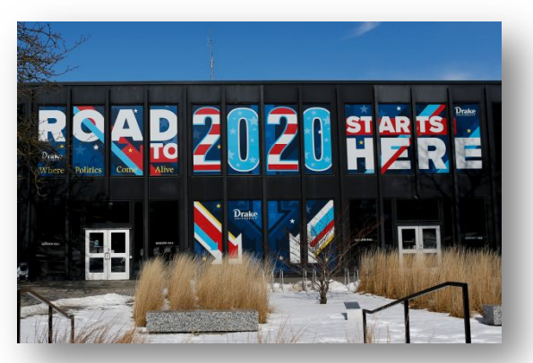
Meredith Hall leading up to the 2020 caucuses