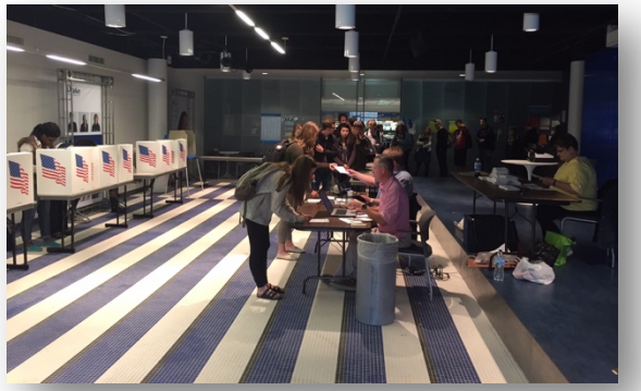
Satellite Voting Location in Olmsted Center in 2018