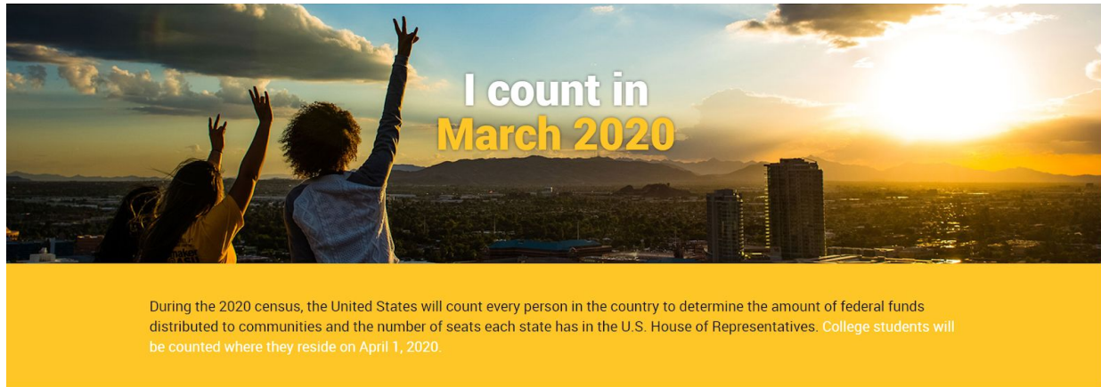
Image: ASU Complete the Count 2020 Census Website Landing Page