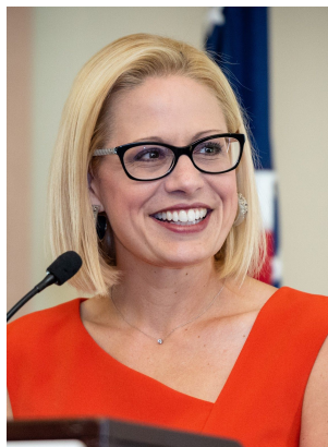
Senator Kyrsten Sinema (D - AZ 9)