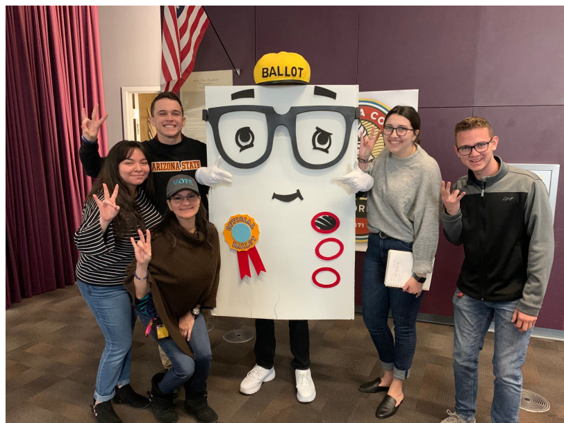
Image #1: 2019 Presidential Preference Roundtable with the Maricopa County Recorder

Image #2: 2019 Town Hall Event with the Maricopa County Recorder’s Office