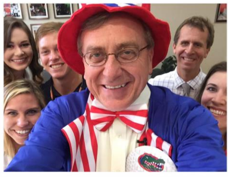
9/11/16, 8:36 PM

Enjoyed filming the voter registration promo for @ChompTheVote and @GrahamCenter